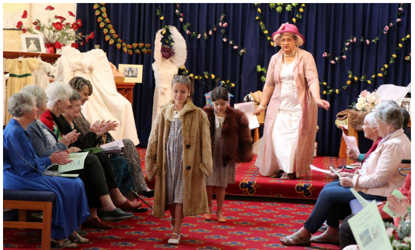
Photographer: Ruth Jennings Spotta Design