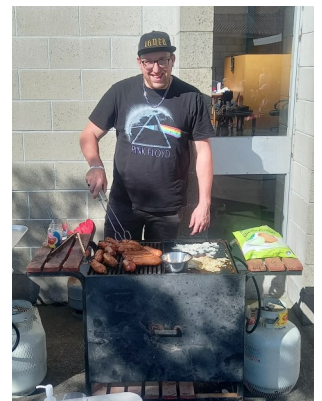
Top & Middle: Hoon Hay Presbyterian Carols Bottom: Cashmere Presbyterian Carols

Two fabulous evenings of celebration and outreach!