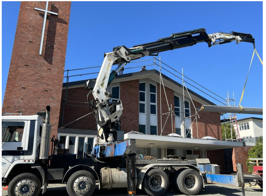
Above: Toys for the boys! Below: working on the hall.

While the roofing damage was an unexpected disaster, there is often a silver lining in these things, and the parish had a one-time opportunity to insulate the main hall area whilst the other work was being done. They will be using a natural wool-based product, cleaner and longer lasting than conventional pink batts.