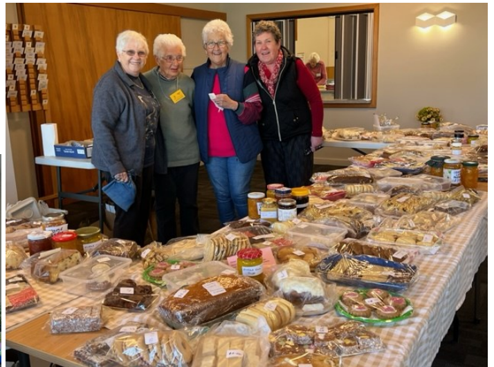
Plants galore, yummy baking, and people lined up down the path, out to the road and down Waiti Road!